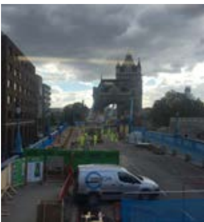
Tower Bridge re-decking