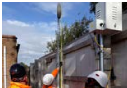
Air Quality Assessment for HS2