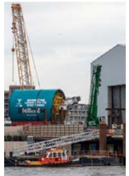
DCO support services Thames Tideway