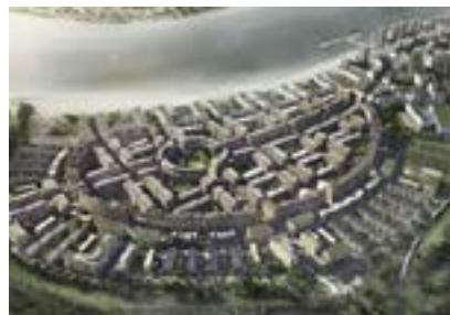
Barking Riverside Regeneration