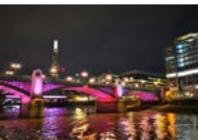
Illuminated River online environmental statement